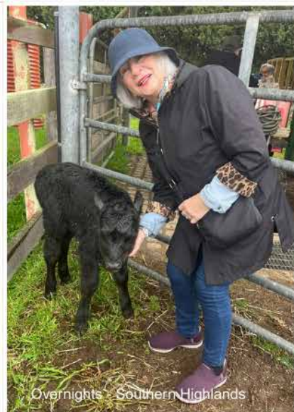
Overnights - Southern Highlands