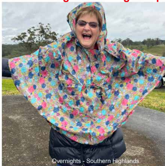
Overnights - Southern Highlands