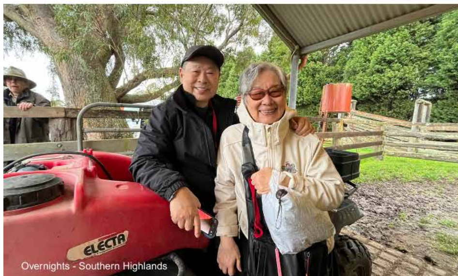
Overnights - Southern Highlands